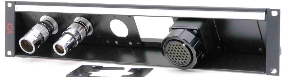
30° 6 Position Modular Bulkhead

*Adaptor plates shown with connectors for illustration