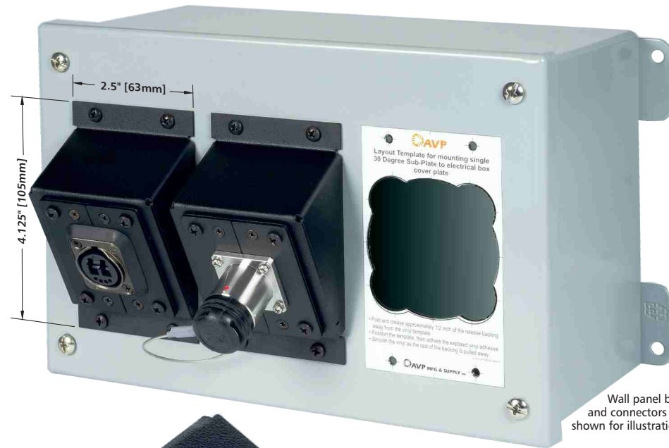
Wall panel box and connectors shown for illustration