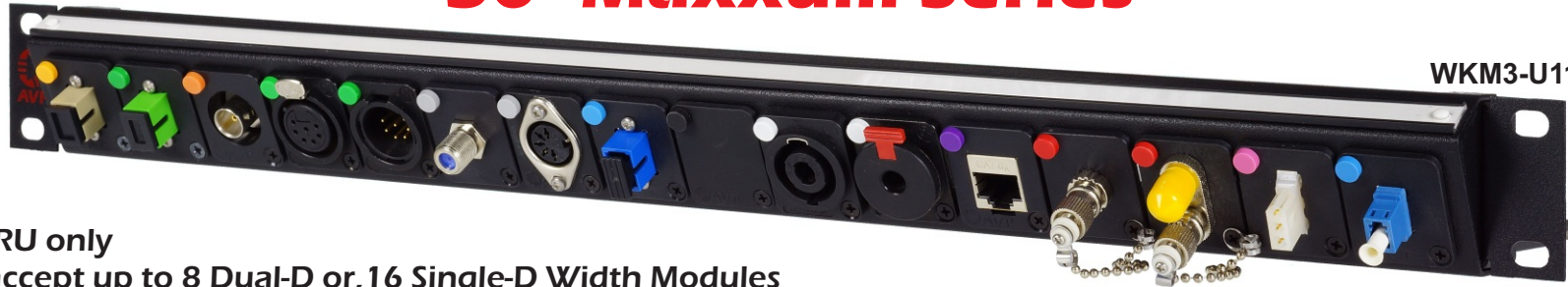
WKM3-U116E1-Z-B36 30°, 1RU 1x16, Dual-D panel, with 3" [75mm] cable bar, empty