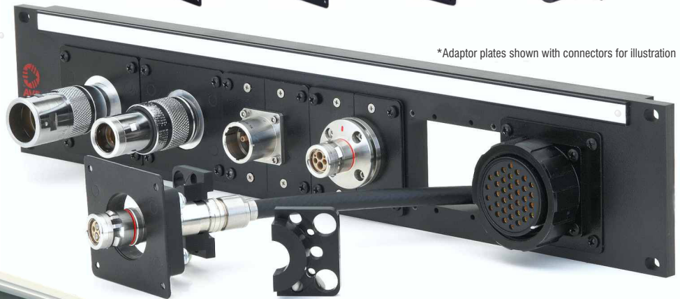
Standard 6 Position Modular Bulkhead