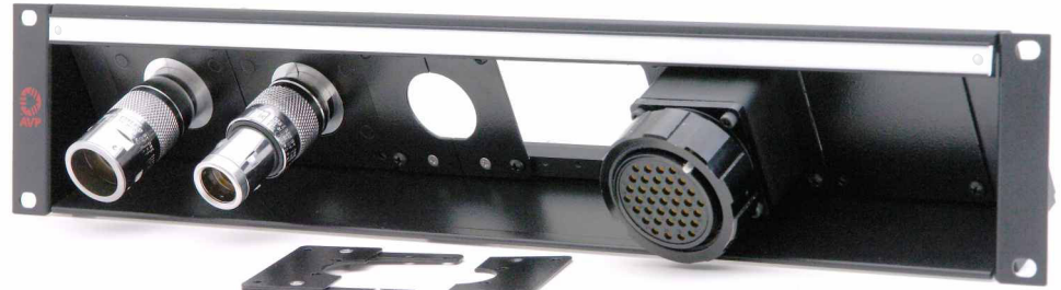
30° 6 Position Modular Bulkhead